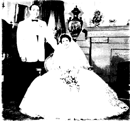
Diocese of Detroit